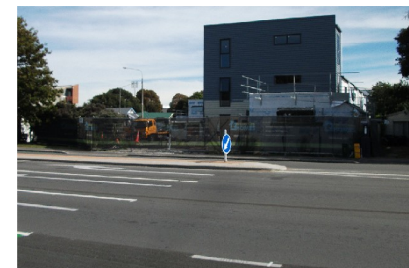
The photo above shows the newest median strip on Lincoln Road. Sadly, the motel on the corner appears to be a very ugly building set far too close to its neighbour.

As the new motel is a private enterprise, owned by overseas investors, I am not sure the ratepayers would be happy to find that their rates are being used to fund a private developer! So much for the Traffic Dept thinking of pedestrian safety first!