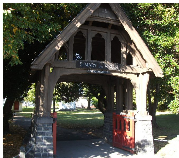
Photo right: St Mary's Lych gate (1921) dedicated "To the glory of God and in memory of the boys of Addington who fought in the Great War 1914-1918"