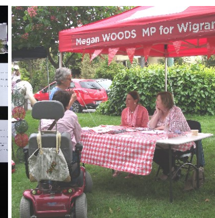
Our MP, Megan Woods, is ready and willing to help.