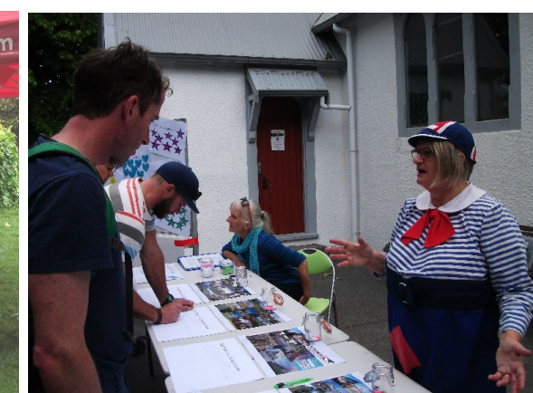
Our Community leaders are keen to canvass our concerns.