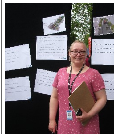
The City Council wants our feed-back on their plans.