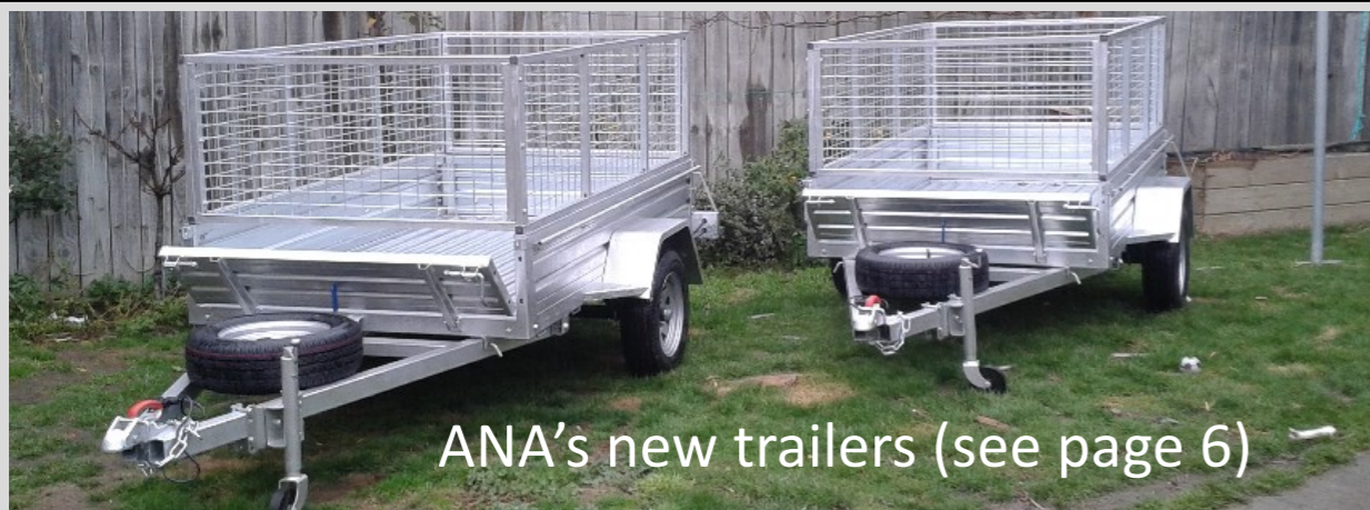
ANA's new trailers (see page 6)