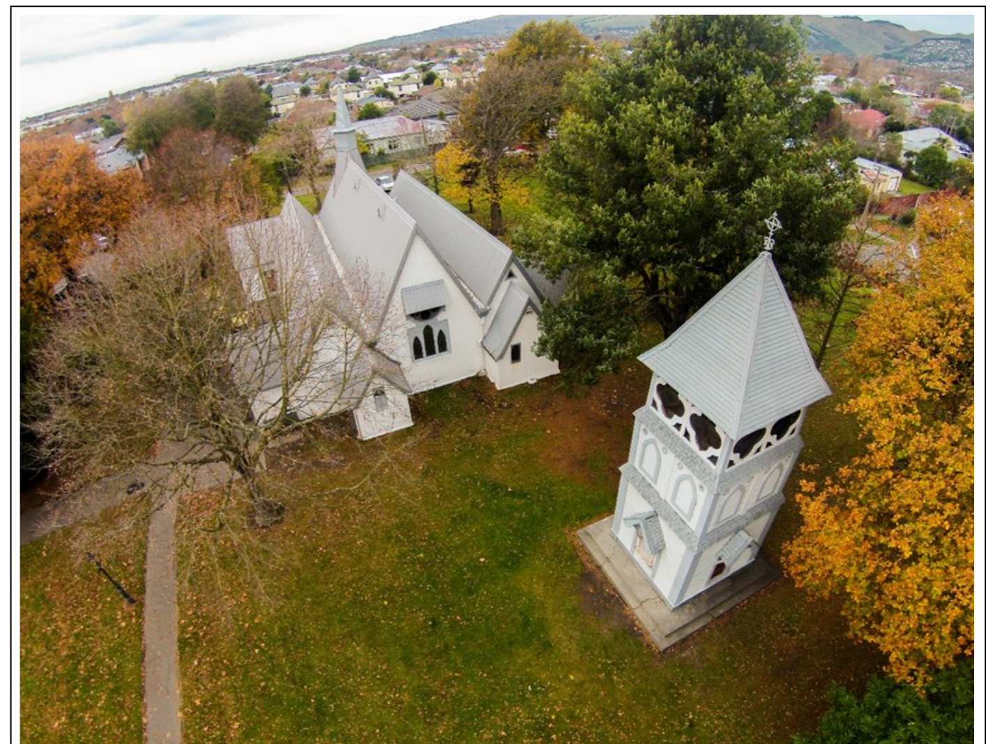
ST MARY'S IN CHURCH SQUARE, ADDINGTON, AS SEEN BY A DRONE CAMERA