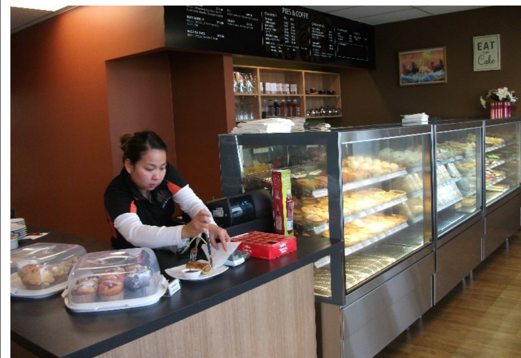
Photo left: Pies and Coffee has opened at the Spreydon end of Selwyn Street. They make all food on the premises and are open from 6am.

Above: the corner of Selwyn Street and Rosewarne Street is ready for development.