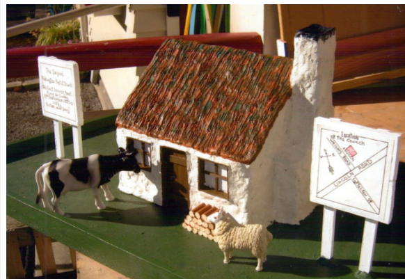
Photos below: left, Mike Burdon's model of the first Baptist church in Addington; centre, the food barn building in Lincoln Road; right, the present day Baptist church in Spreydon.