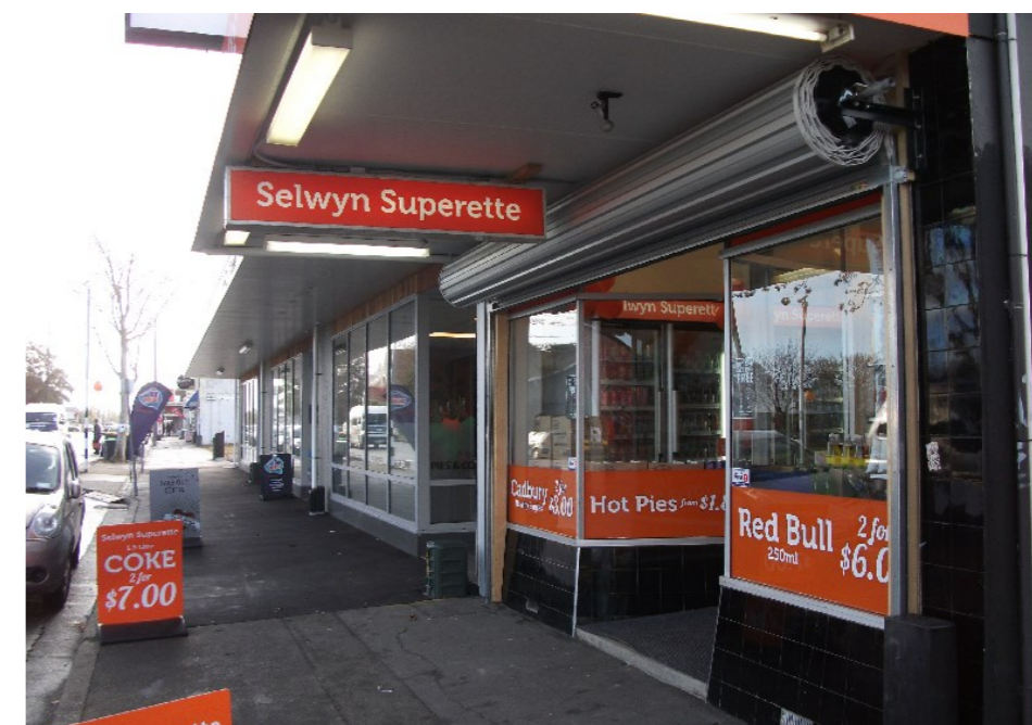
Photo right: next door to Pies and Coffee, the Selwyn Superette is up and running.

Photo left: Pies and Coffee has opened at the Spreydon end of Selwyn Street. They make all food on the premises and are open from 6am.