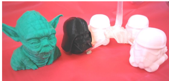
Photo above: Our 3D printer produced these great Star Wars characters.