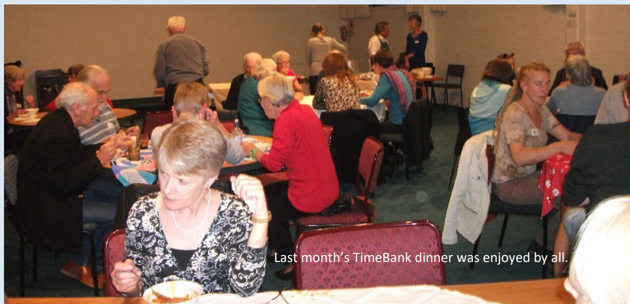
Last month's TimeBank dinner was enjoyed by all.

If more than six people are interested we could run a second workshop.