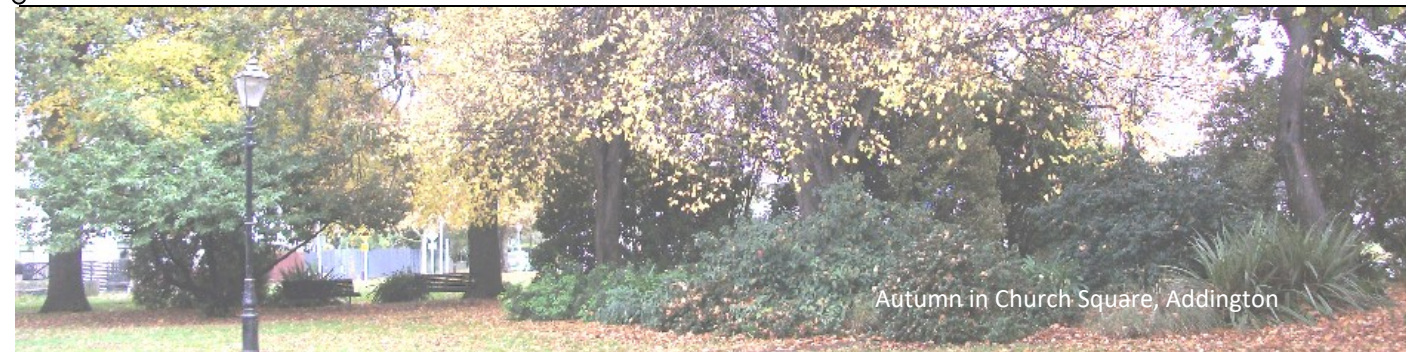
Autumn in Church Square, Addington

ADMISSION FOR EACH SHOW (cash only) $20—waged $15—unwaged/seniors