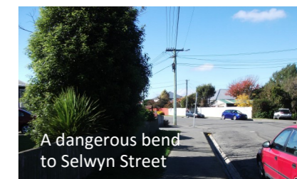
Photos below were taken before the flag referendum