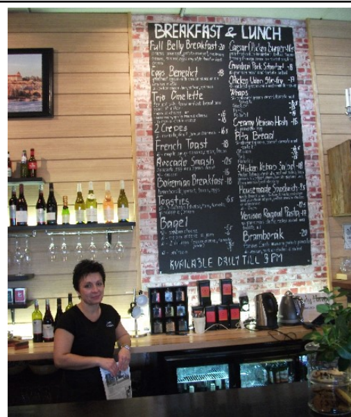
CAFÉ PRAGUE . We hear that they have a whole new winter menu for breakfast, lunch and dinner -compliments of their talented continental chef at 359 Lincoln Road.