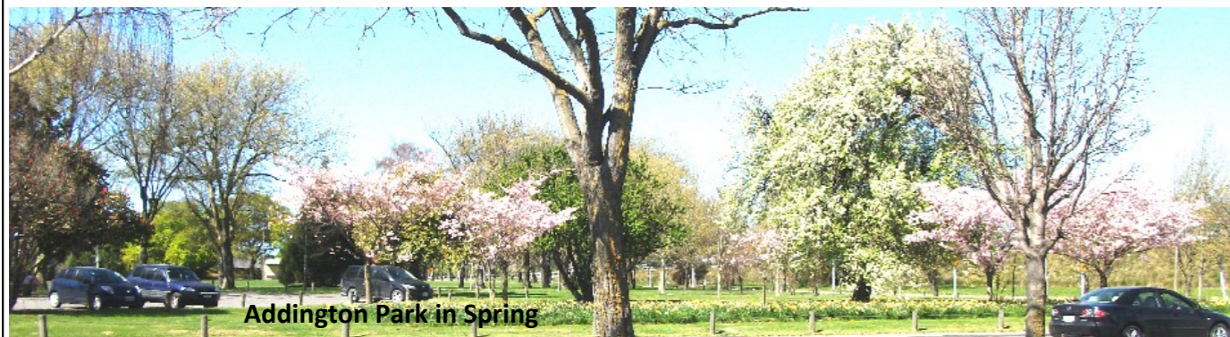
Addington Park in Spring

N.B. You will find the answers in November's edition of the Addington Times , but come to the Hidden Histories (Beca Heritage Week) Concert at St Mary's, 18 October, 6– 8.30 pm, and be in to win a prize.