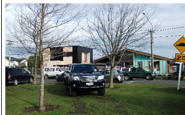
Photo above: traffic problems on the West side of the square are currently compounded by trade vehicles parking in front of two homes currently under construction.