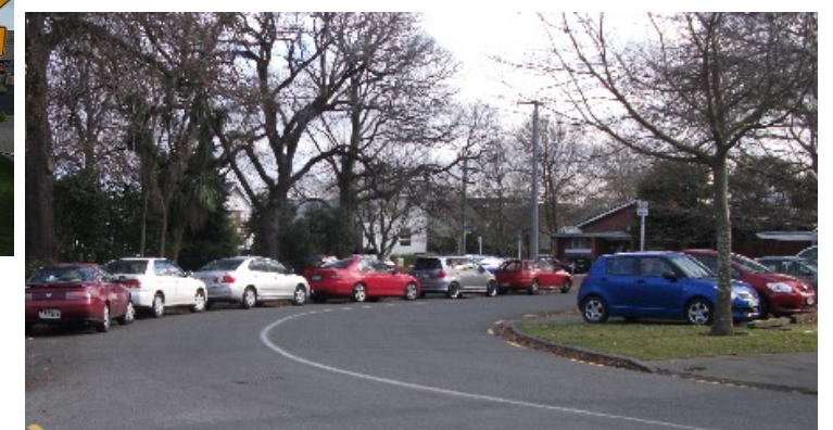
Photo below: a sweeping curve on the East side of the square makes it difficult for pedestrians and regular traffic to avoid speeding drivers.