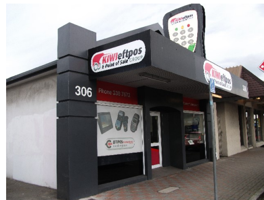
Photo below: 306 Lincoln Road is now occupied by Kiwiflpos. How technology has changed!