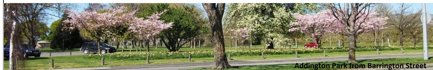
Addington Park from Barrington Street

The protesters were concerned that new workers would be casualised to such an extent that "they would not know from one month to the next which days and start and finish times they [would be] working." They said, "We enjoy our jobs, but have lives outside of work, too. Some of us have children. Others have commitments to community, faith and sports groups. Many of us study, with set lecture times. Chopping and changing our hours every month may suit ANZ but it does not work for us and our families."