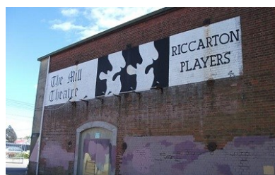
Still standing—just! The Mill Theatre.

Patrons of The Miller Bar in Lincoln Road will be familiar with its photo-mural depicting the bowlers, the mill, and other activities, back in the day.