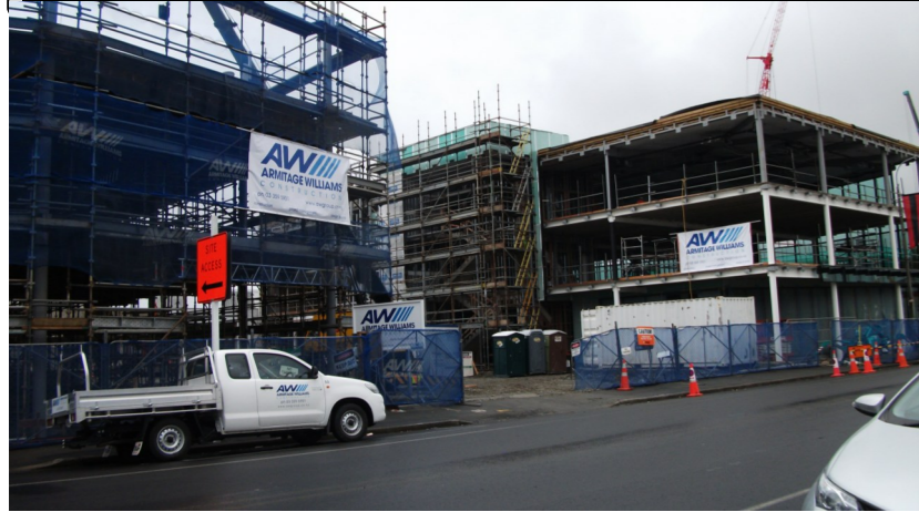
At the city end of Lincoln Road some very large commercial buildings are going up, and opposite the ANZ bank another bar is about to open.