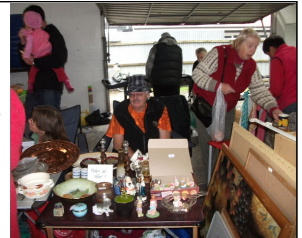
Everything at 7 Dickens St. was for sale pending our move to St Mary's. Thanks to all our wonderful volunteers and stall holders.