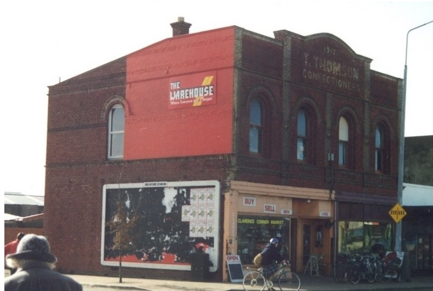
Photo: The Thomson Building,