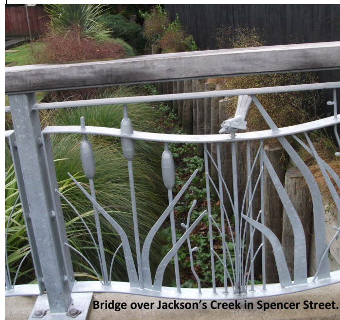
Bridge over Jackson's Creek in Spencer Street.

Further information from: www.local.ccc.govt.nz/insite/