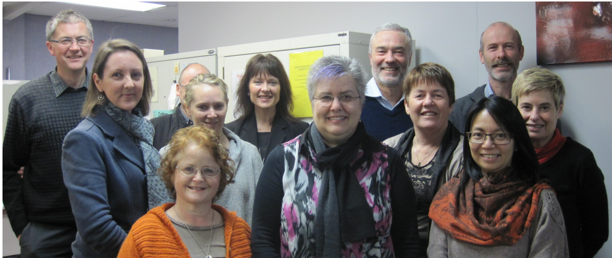
Photo above: Staff at Kingdom Resources are ready to help.

Kingdom Resources, based in Addington Mall, has helped thousands of people in Christchurch with interest free loans, free budgeting and employment advice since it was first launched in 1988.