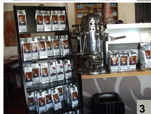
Photos: (1) packing seen through the viewing window; (2) looking into the warehouse; (3) Hummingbird coffee for sale at Oddfellows Café.